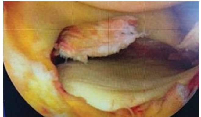
Figure 1 - Arthroscopic medial compartment demonstrating significant tibial sided meniscal lift-off and drive-through sign.

Post-operatively patient was locked at 30° in a TROM brace and made toe-touch weight bearing for 6 weeks.